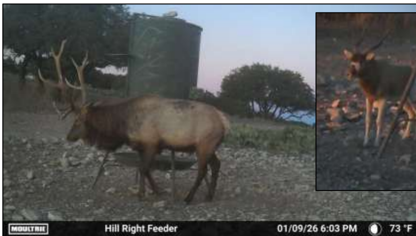
Hill Right Feeder