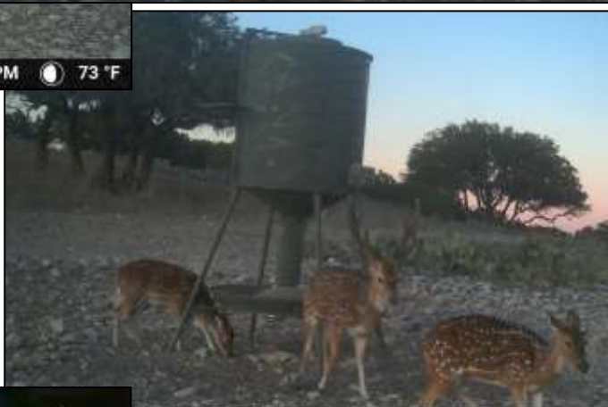
Hill Right Feeder